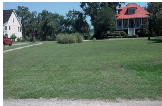
View from back entrance to large corner lot