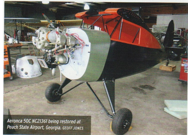
Aeronca 50C NC21361 being restored at Peach State Airport, Georgia.

The aircraft has just one entry door. The fitting of a second door was a 1938 factory option that would have cost an extra five dollars. The Aeronca is expected to make its first flight in May and is likely to appear at the EAA AirVenture at Oshkosh, Wisconsin, in July.